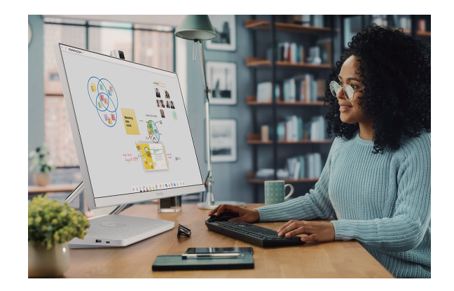
Cloud application – allows everyone to join and collaborate at any place